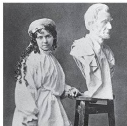
Vinnie Ream, sculptor of the statue of Abraham Lincoln that stands in the U.S. Capitol Rotunda.

Vinnie Ream was the first woman and the youngest artist to ever receive a commission from the United States government for a statue. She was an "Omnibus child prodigy" with remarkable talent. She was also a member of the National League of American Pen Women, Inc.